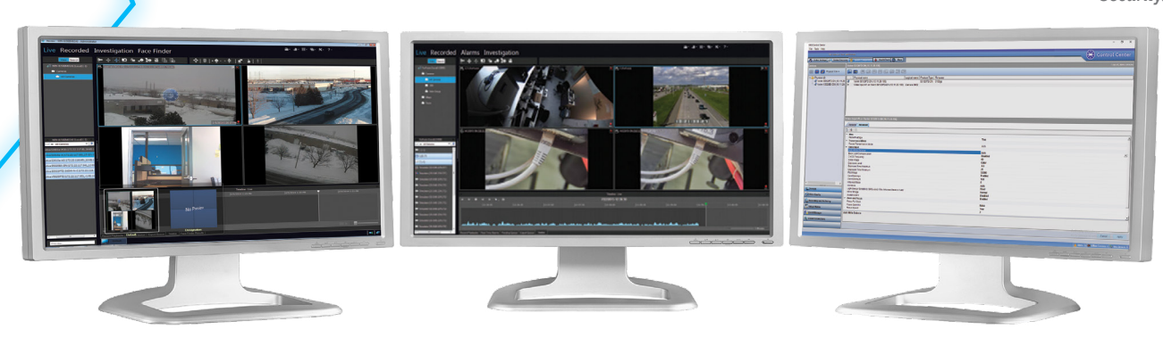
Comprehensive video monitoring, management and health awareness.